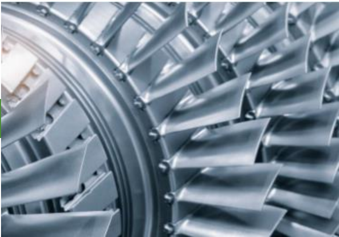
Aviation & Marine